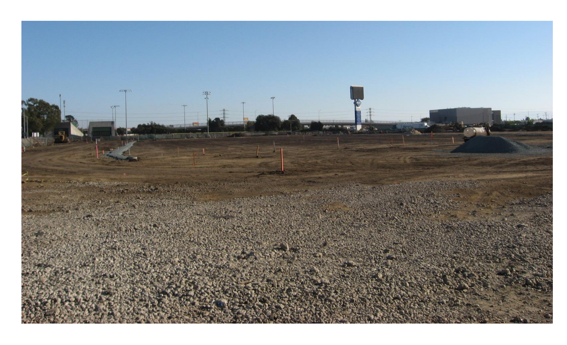
SLUSD Pacific Sports Complex & Burrell Field: grading of football field