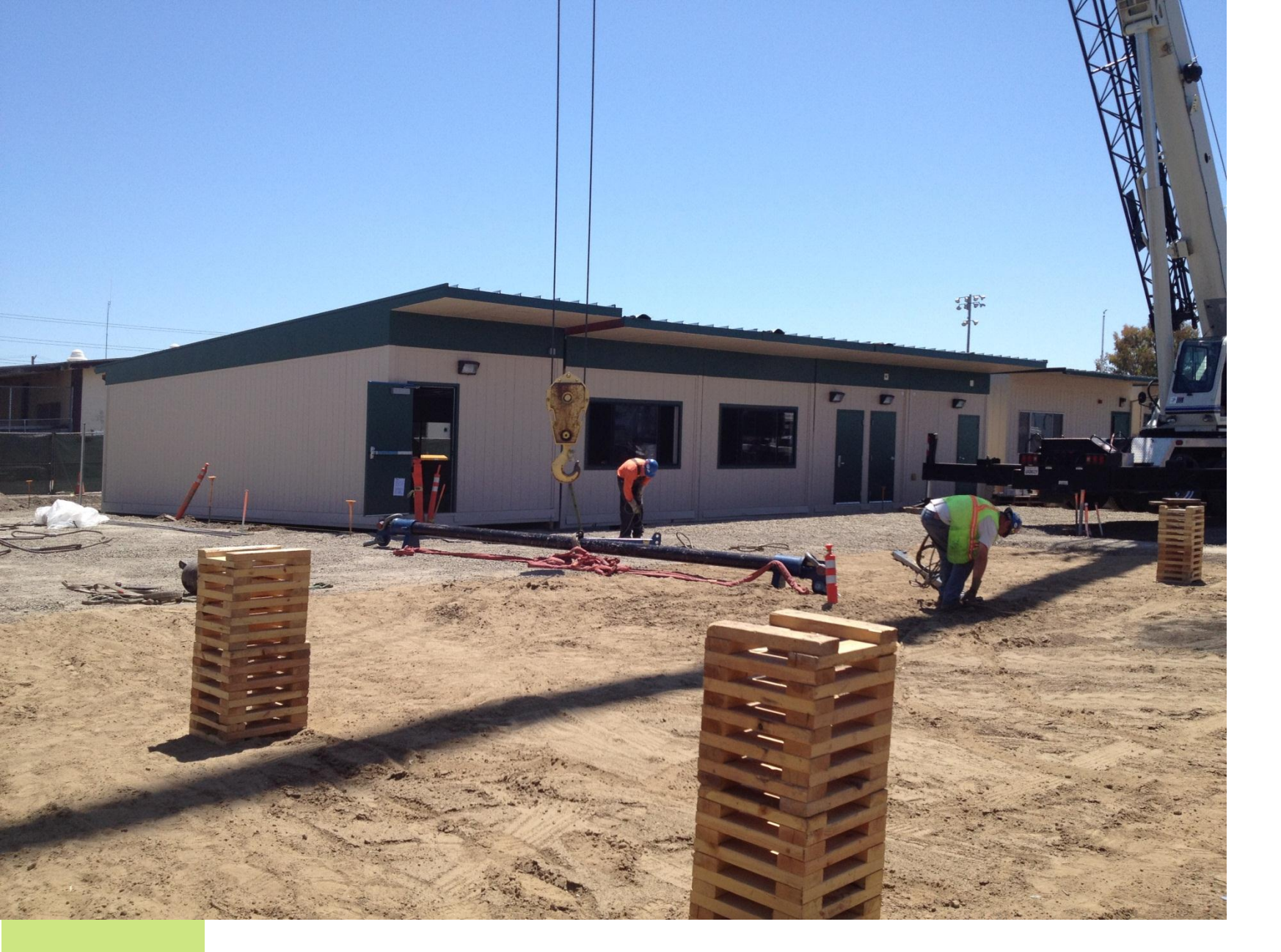
Lincoln Alternative High School

Crane dropping in the new double-wide classroom, good for large meetings