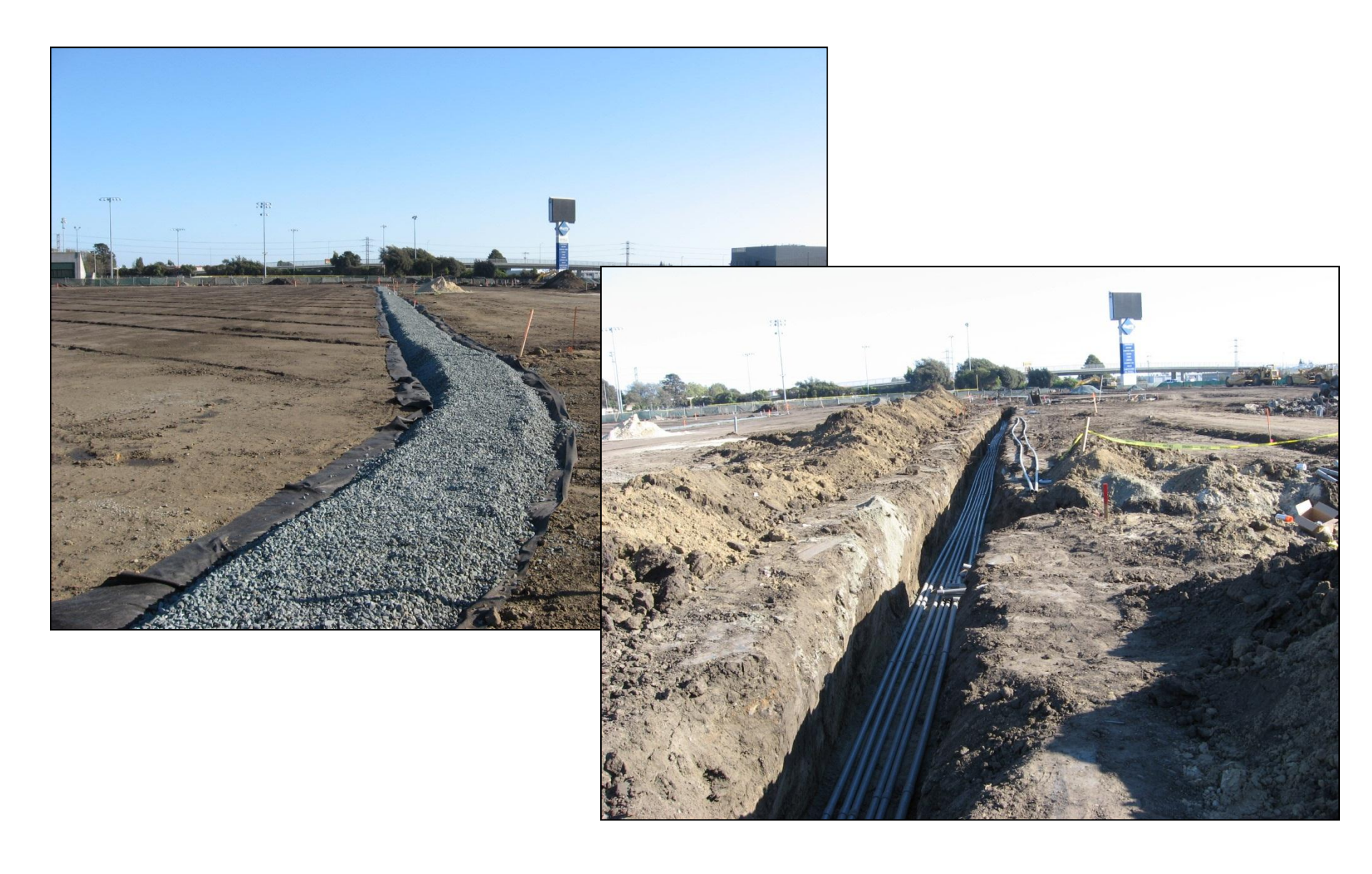
SLUSD Pacific Sports Complex & Burrell Field: Drainage and underground utility