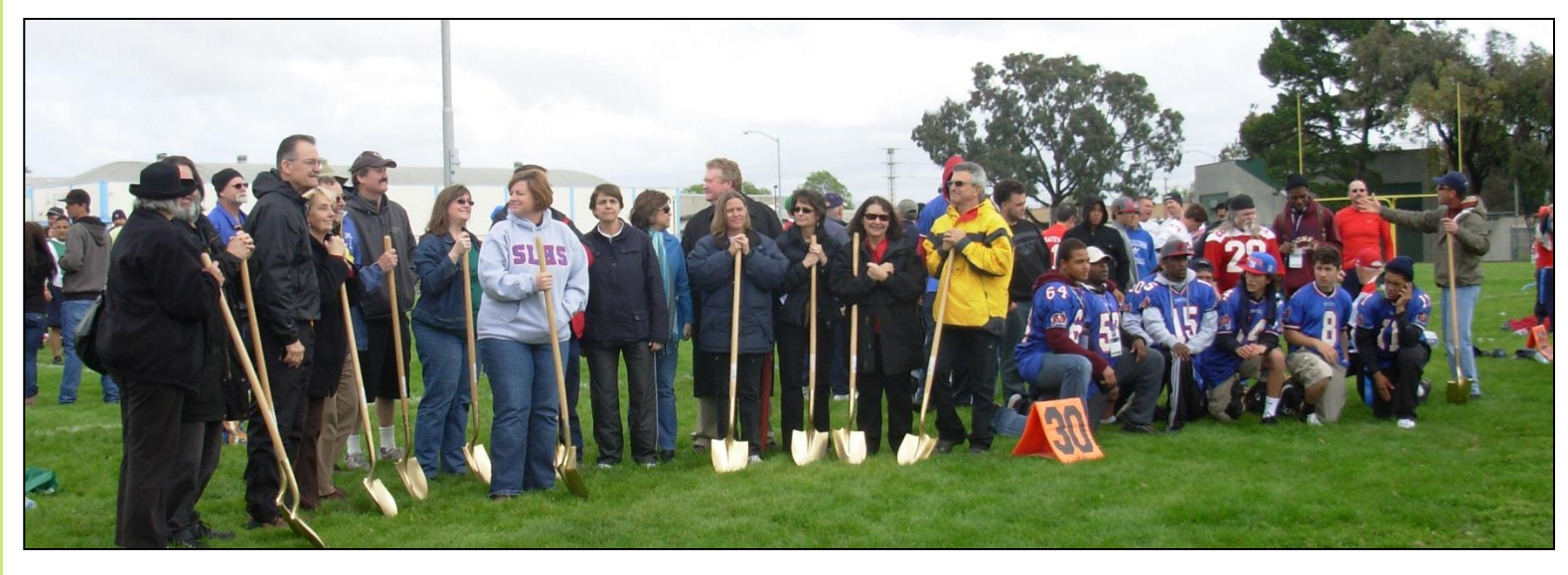
SLUSD Pacific Sports Complex Groundbreaking on March 31, 2012